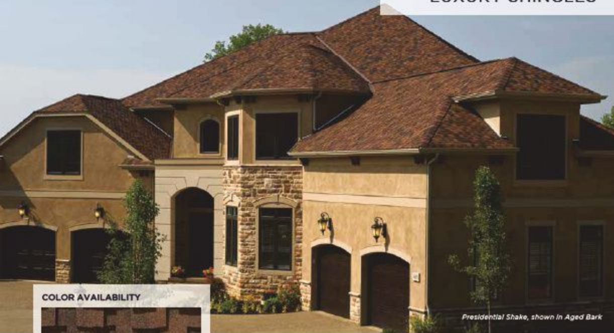
Presidential Shake, shown in Aged Bark